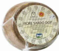
Fiore Sardo Cheese