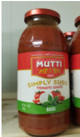
Pomodoro Sugo al Basilico Mutti