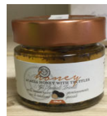
Truffle Honey Acacia Flowers