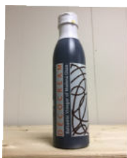
Balsamico Glaze From Modena