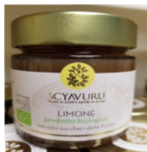
Limone Preserve Organic/ Sicily