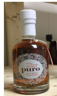
White Balsamic PURO aged in Barrique