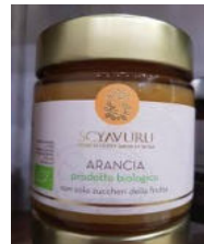
Orange Preserve Organic/ Sicily