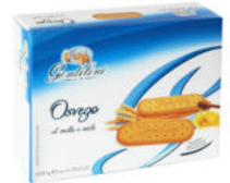
Biscotti Osvego 1 kg.