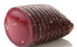
Bresaola di Manzo