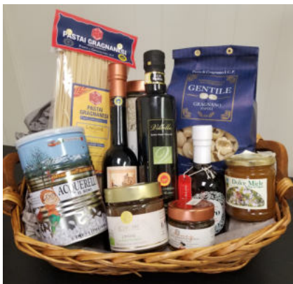
Small size Basket 10-12 items Around $ 149

With all our items we can make, at your taste, outstanding Gift Baskets. We also prepare Gourmet Boxes with our Cheeses, Charcuterie, fresh Truffles and Caviar. Let's us know in advance!