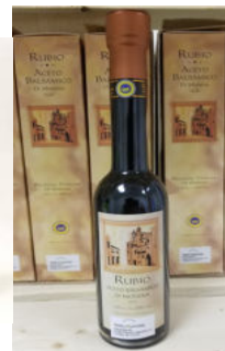
Rubio Balsamic 12 years aged IGP