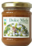
Sicilian Raw Oregano Honey