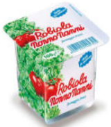
Robiola Fresca Cow Milk