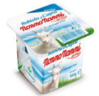
Robiola Fresca Goat milk