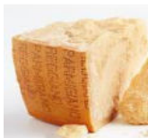
Parmigiano Reggiano DOP