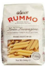
Pasta Rummo Penne Rigate