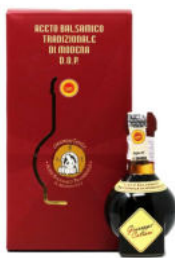
Balsamico Vecchio 12 years aged