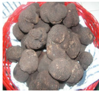
Winter truffle Season Dec/March.