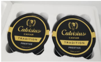
Tradition- Prestige Calvisius Caviar.