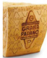
Grana Padano DOP