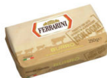
Burro (Butter) From Italy