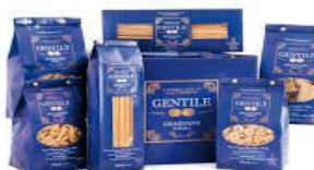
Gragnano Pasta Gentile