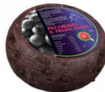
Predicatore Pecorino alle Vinacce