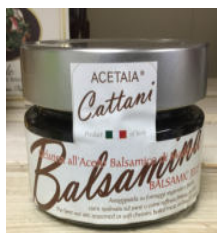
Balsamic Jelly IGP from Modena