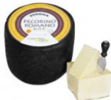
Pecorino Romano DOP