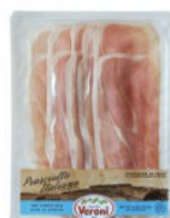
Pre-sliced Prosciutto Italiano