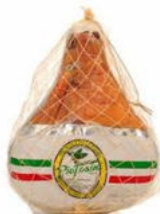
Prosciutto Crudo Pio Tosini DOP