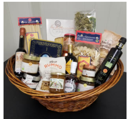
Large size Basket 18-20 items Around $ 259

The prices of the basket doesn't include ground shipments. Ground Shipment Prices are around: In State shipment , $ 14.00 East-Coast , 16-18 dollars – Central 20-24 dollars. West Coast 30-34.