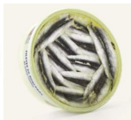
White Anchovies Boquerones