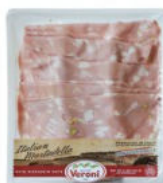
Pre-sliced Mortadella Pistacchio