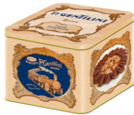
Biscotti Gentilini 500gr.