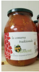
Tomato "Piennolo" From Vesuvio Slow Food Presidio