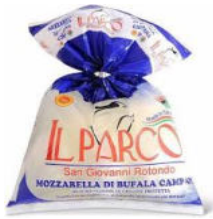
Mozzarella Bufala DOP from Apulia