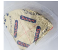
Gorgonzola Dolce DOP