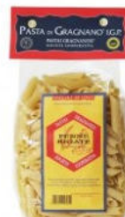
Penne rigate Gragnano IGP