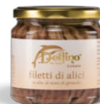
Anchovies Delfino In Oil from Cetara