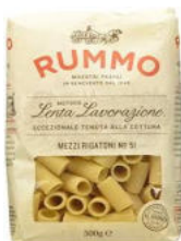
Pasta Rummo Mezzi rigatoni