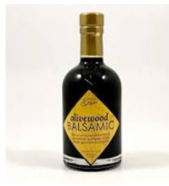
Balsamic 8 years Aged in Olivewood