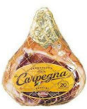
Prosciutto Crudo Carpegna DOP