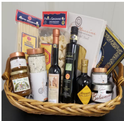
Medium size Basket 14-16 items Around $ 199