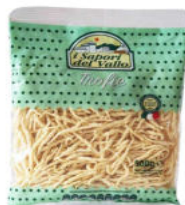
Trofie Fresche From Italy