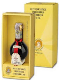
Balsamico Stravecchio 25 years aged