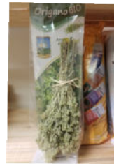
Organic Dried Origano/Sicily