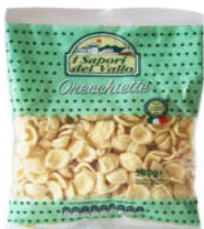
Orecchiette Fresche From Italy