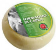
Formaggio Di Capra 120 days