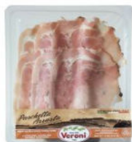
Pre-sliced Porchetta Arrosto