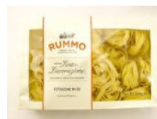
Pasta Rummo Egg's Fettuccine