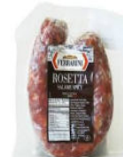
Rosetta Salame Spicy Parma