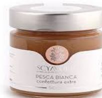
Peach Preserve Organic/ Sicily