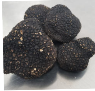
Autumn truffle Season Oct/Nov.