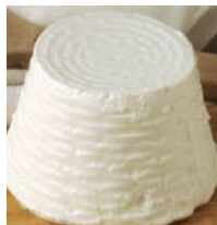
Ricotta Fresca di Bufala Pugliese