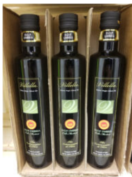
Vilella DOP EVOO