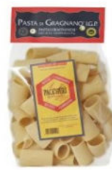
Paccheri Gragnano IGP