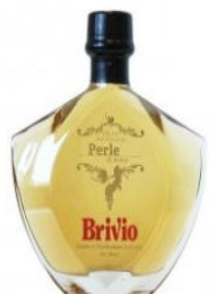
White Balsamico Brivio of Modena