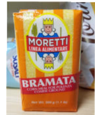
Polenta Bramata Moretti