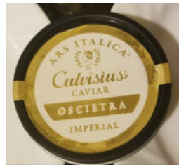
Oscietra Calvisius Caviar.

With all our items we can make, at your taste, outstanding Gift Baskets. We also prepare Gourmet Boxes with our Cheeses, Charcuterie, fresh Truffles and Caviar. Let's us know in advance!