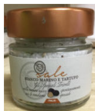
Truffle Sea Salt