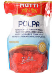
Mutti Tomato Polpa from Italy