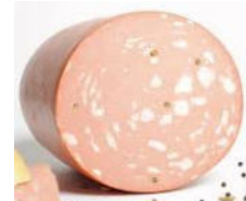
Mortadella Italiana With Pistachio