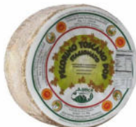
Pecorino Toscano Aged DOP