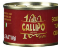
Callipo Tuna di Calabria in Oil