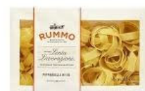
Pasta Rummo Egg's Pappardelle