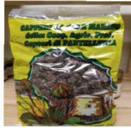
Capers Large Pantelleria