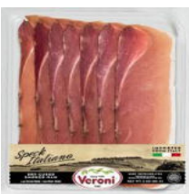
Pre-sliced Speck Alto Adige