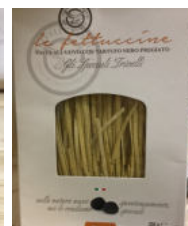
Black Truffle Fettuccine