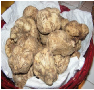
White truffle Season Oct/Dec.