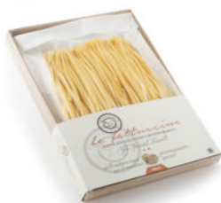
White truffle Fettuccine