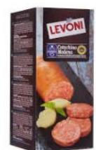
Cotechino Pre-cooked from Italy