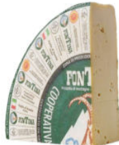
Fontina DOP Valle D'Aosta