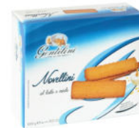
Biscotti Novellini 1 ka.